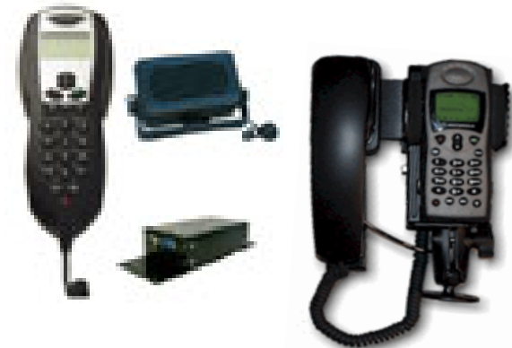
Vehicular Mount and Docking Stations