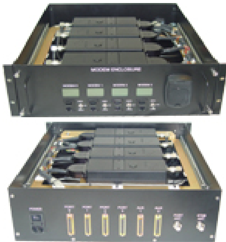
Multi-Channel Fixed Service