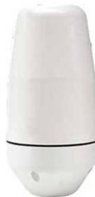
A variety of fixed antenna options