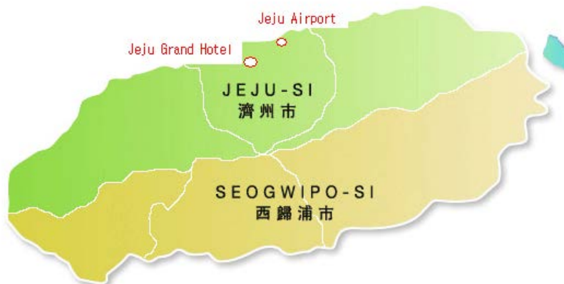
Figure 1. Jeju Map

Jeju Island is an island off the southern coast of South Korea in the Korea Strait. The main town and capital is Jeju City (Jeju-si).