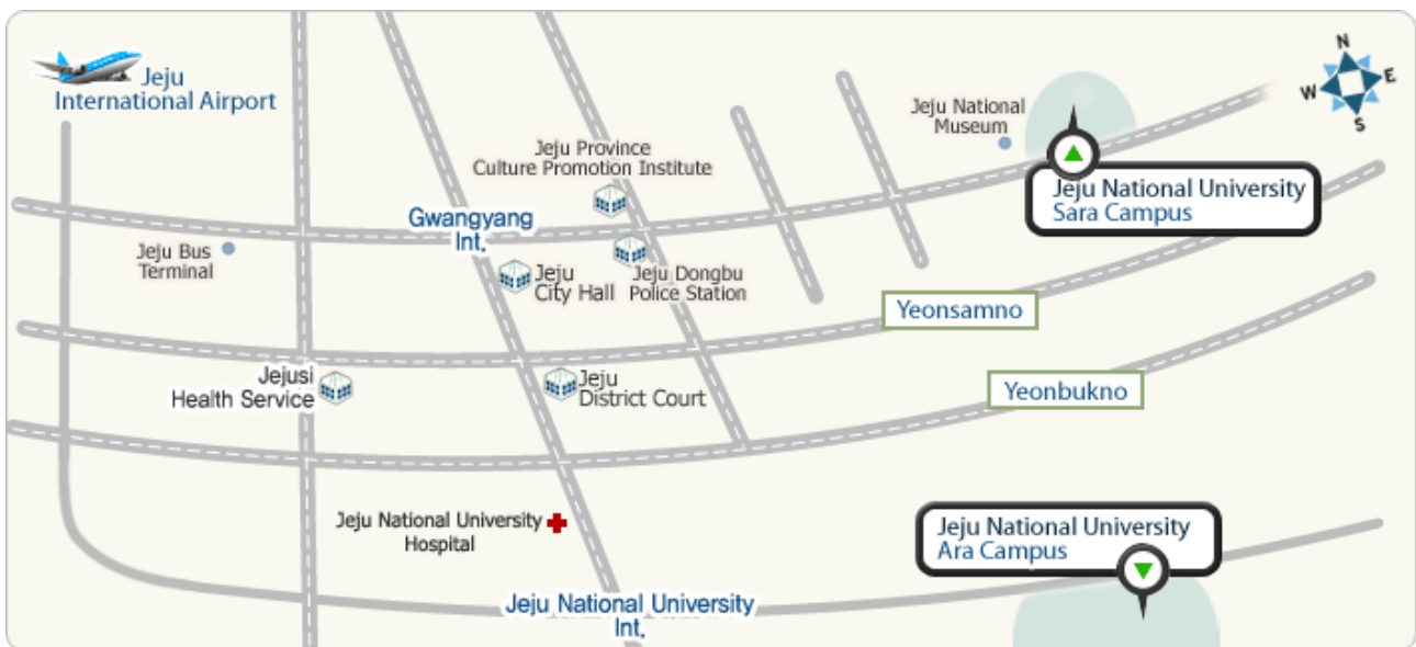
Figure 3. Jeju-si Area

The figure below shows the map of the Jeju-si area, the ARA campus on the lower right.