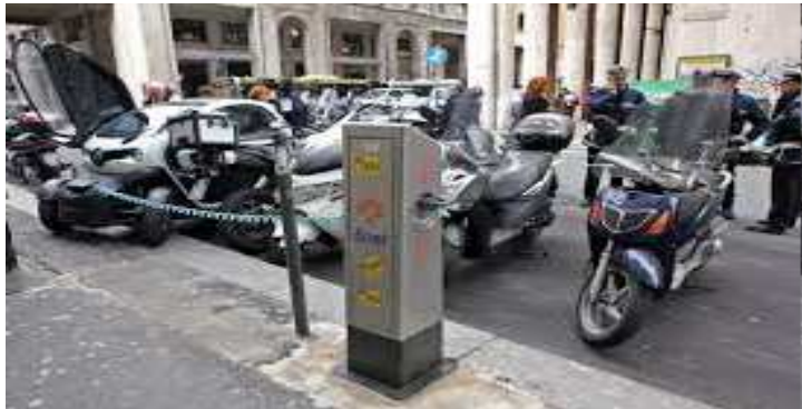
Electrical Vehicles Action Plan