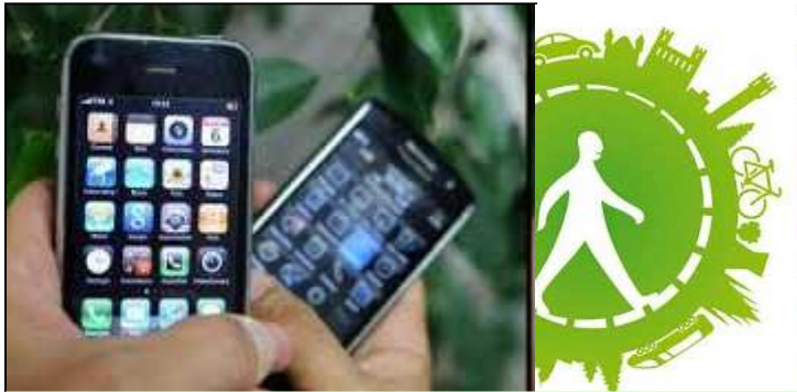
ICT for SMART MOBILITY FP7 – Project “Opticities”