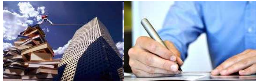
Capacity building for smart city planning LLP/Leonardo (Innovation