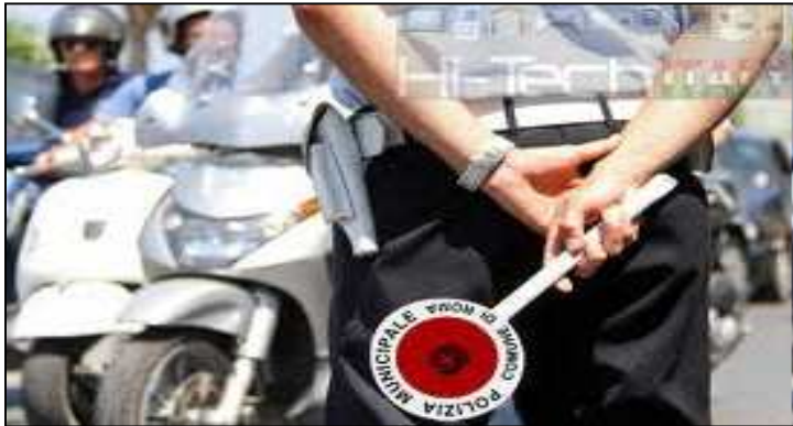
ICT for URBAN SECURITY FP7 – Project “ Watch n’ shout ”