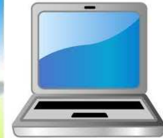
ICT for WASTE MANAGEMENT FP7 – Project “ALMANAC”