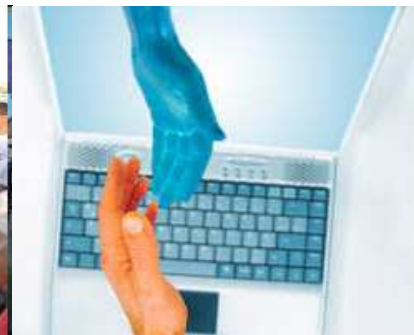
ICT for environmental education and policy making