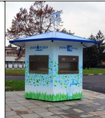
ICT for efficient WATER USE FP7 – Project “ YDOR ”