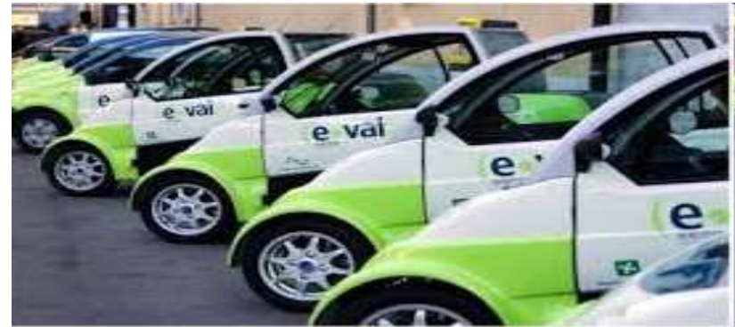
EV Carsharing System