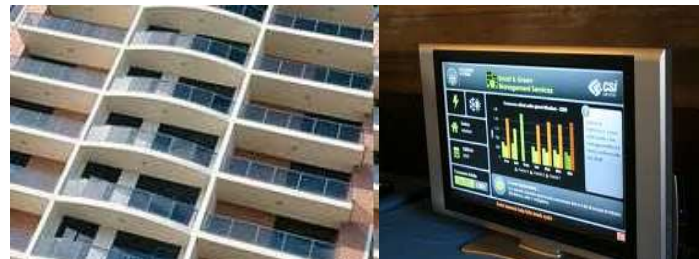
ICT for ENERGY EFFICIENT BUILDINGS FP7 – Project “TRIBUTE”