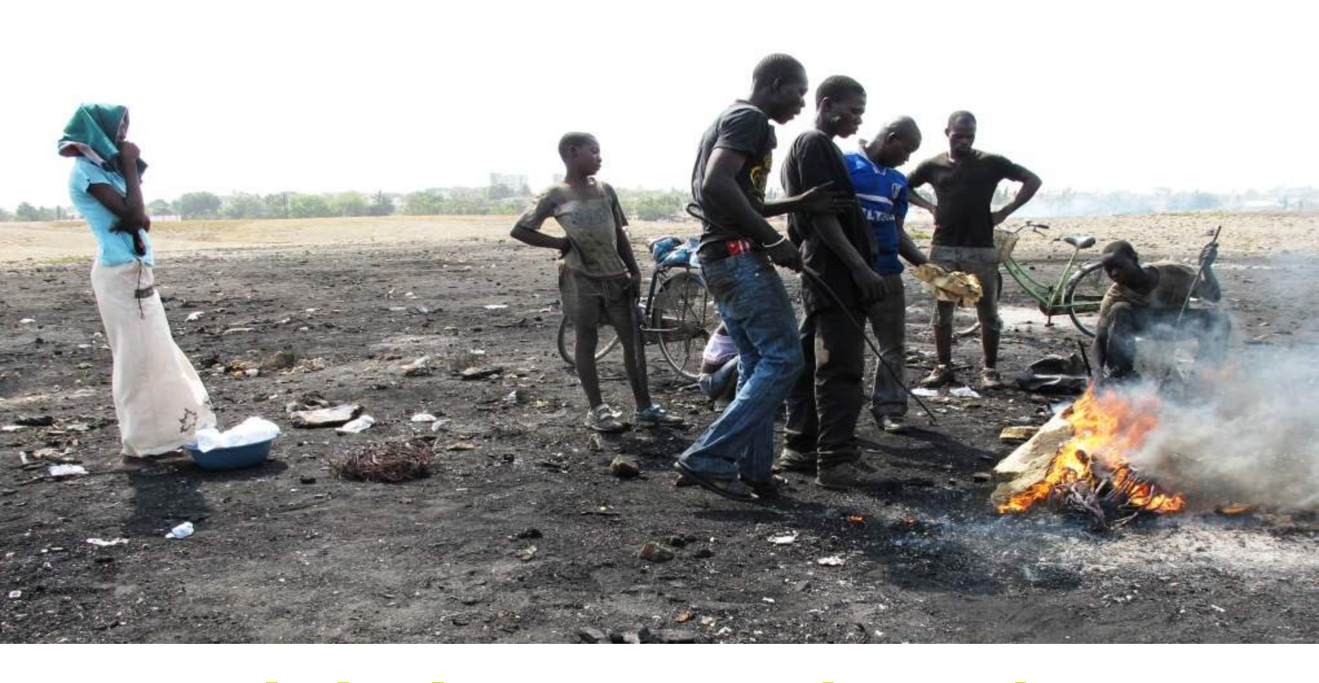
global e-waste dumping