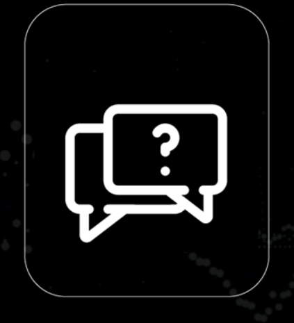
QUESTIONS & ANSWERS