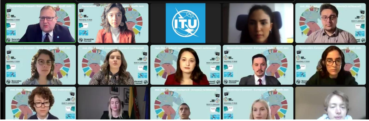
Figure 1 Virtual Group Photo

The main outcomes of the briefing are outlined in this report, which structures the key points that emerged during each session of the event.