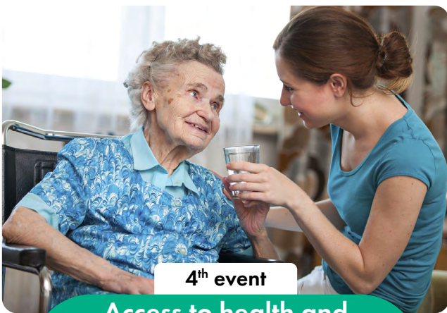
4 th event

Access to health and social care services: Further vulnerabilities merging from ageing