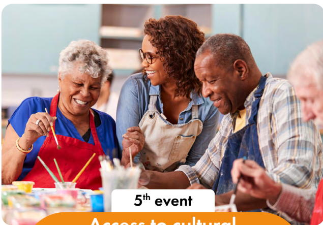
5 th event

Access to cultural and leisure activities: Tackling Individual interests and inter-generational social construction