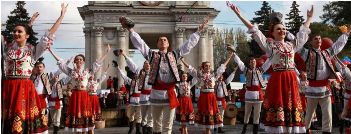
Traditional dance: Photo credit www.moldova.md