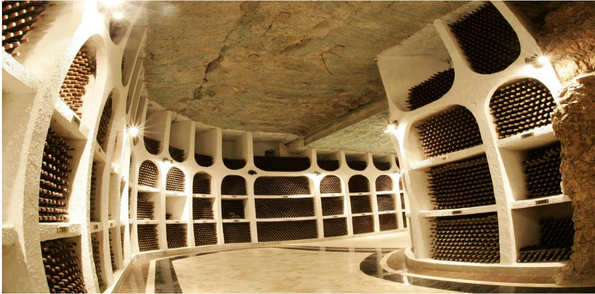
Cricova winery: Photo credit www.moldova.md

While traveling Moldova it is impossible to miss national cuisine. Many may find it similar to Romanian or other East European however, national culinary traditions infuse in it many distinct notes making its taste particularly delicious. Popular Local specialties include mititeyi (small grilled sausages with onion and pepper) and mamaliga (thick, sticky maize pie) which is served with brinza (feta cheese) and Tocana (pork stew).