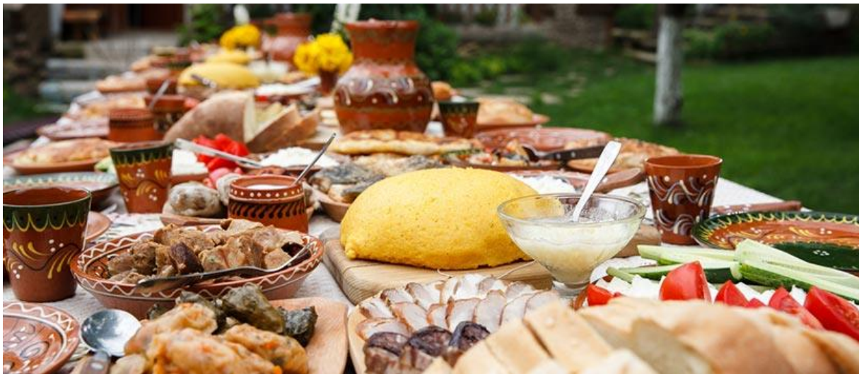
Moldovan cuisine: Photo credit Google

While traveling Moldova it is impossible to miss national cuisine. Many may find it similar to Romanian or other East European however, national culinary traditions infuse in it many distinct notes making its taste particularly delicious. Popular Local specialties include mititeyi (small grilled sausages with onion and pepper) and mamaliga (thick, sticky maize pie) which is served with brinza (feta cheese) and Tocana (pork stew).