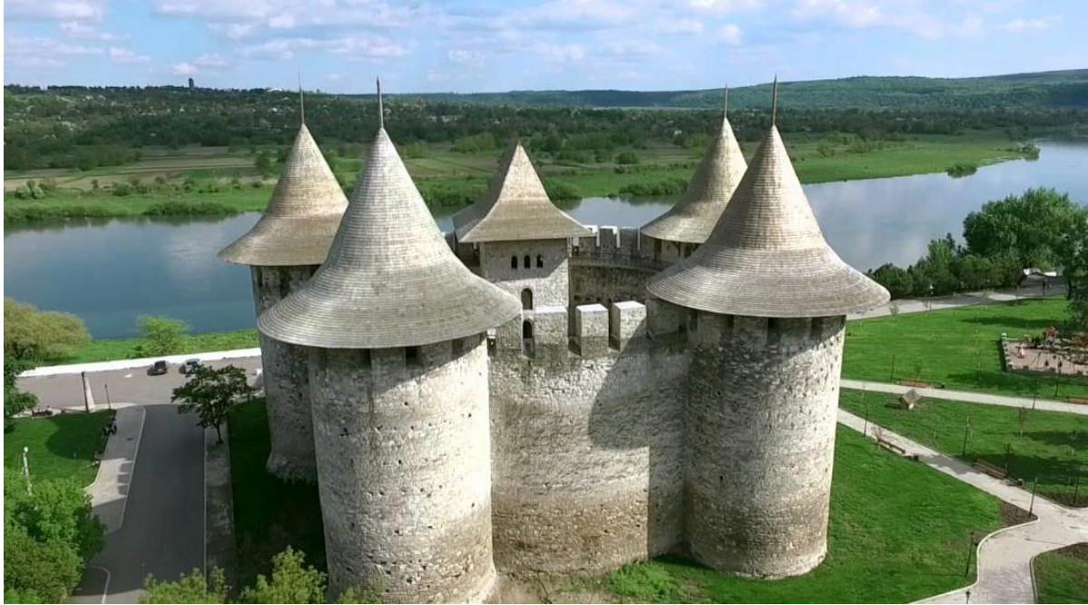
Cetatea Soroca: Photo credit www.moldova.md

Connoisseurs of deep culture may visit “National Museum of History of Moldova” and “National Museum of Ethnography and Natural History” where are present exhibits of multiple rare and even unique collections.