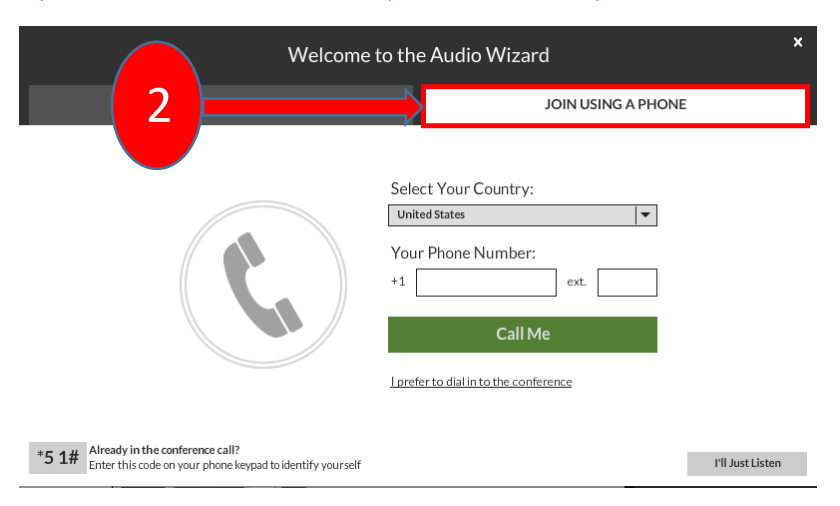
Option 2: Dial-In or dial-out to yourself over the phone

By choosing this option, you can only listen to the conference in English . You won't be able to speak. A chat box is available if you wish to make some comments.