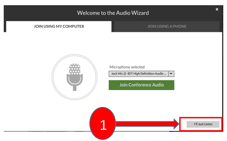
Option 1: Listen through computer speaker

By choosing this option, you can only listen to the conference in English . You won't be able to speak. A chat box is available if you wish to make some comments.