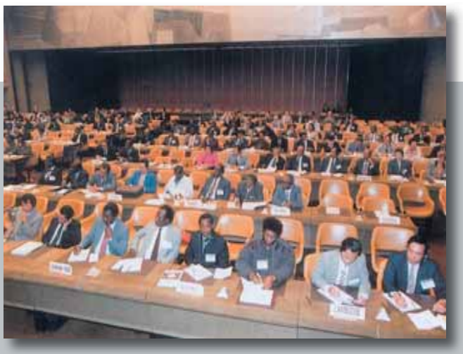
Participants in the Workshop of 1995

Today, it is clear that a targeted approach is essential in order to address information, technology and service availability imbalances. For these reasons the TDS is more important than ever in bridging development gaps. The TDS is in line with ITU's overall ICT development role and also complements the main TELECOM Forum, by providing a focus on the needs of developing countries. Some of the benefits of TDS include: