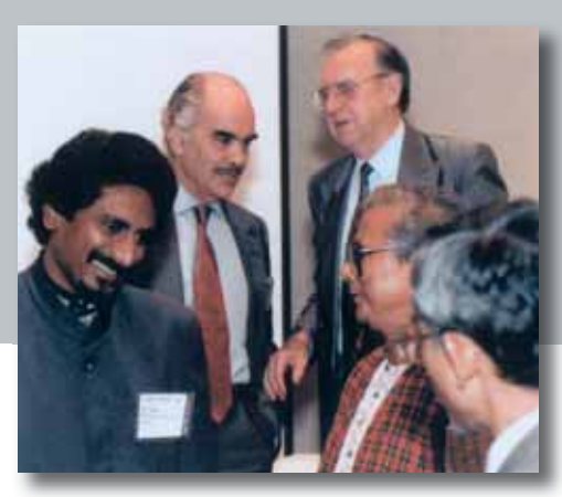
The Distinguished Speakers in past TDS Programmes

Core Part of ITU's mission: TDS is the embodiment of one of ITU's main roles, to help extend the reach of ICTs.