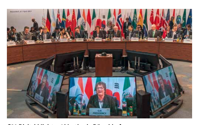
G20 Digital Ministers' Meeting in Düsseldorf

At the first G20 Digital Ministers' Meeting in April 2017, the German presidency sent a clear signal in favor of intensifying international cooperation in the field of inclusive digitalization, with important agreements having been made.