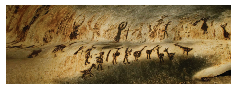
Ancient stone drawings "Magurata" cave West Fore-Balkan

• Initiatives promoted among the Western Balkan countries relating to Broadband for All, high-speed cross-border connectivity and gradual reduction/abolition of roaming charges for these countries. Thus Bulgaria will contribute to WSIS Action Line 2 and hence - the implementation of the Sustainable Development Goals.