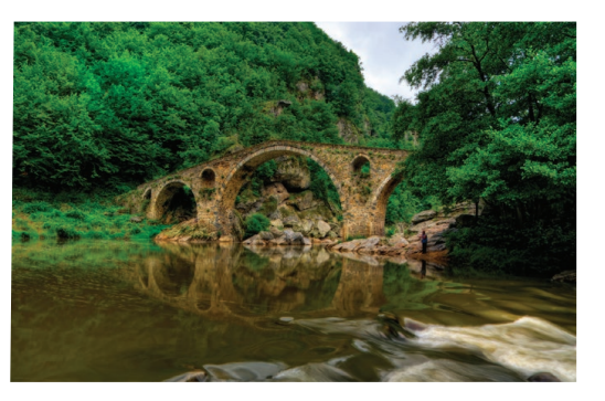
Dyavolski most "Devil's bridge", Arda River Rhodope Mountains

• Active participation in debates on key issues within the remit of the ITU.