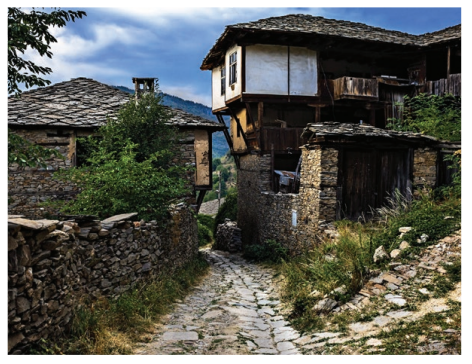
Historical village of Kovachevica, West Rhodope