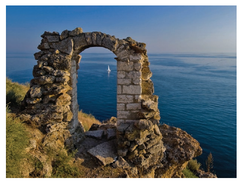
Cape Kaliakra, Black sea

• Successful implementation of two pilot projects within the framework of the ITU regional cooperation: (1) Provision of IT skills and specialized hardware equipment and software for elderly people and for people with visual impairments, and (2) Provision of free internet access for the residents of a border region in Bulgaria.