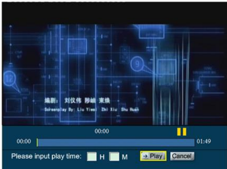
Figure II.1 – Example of the Event object controlling the media status