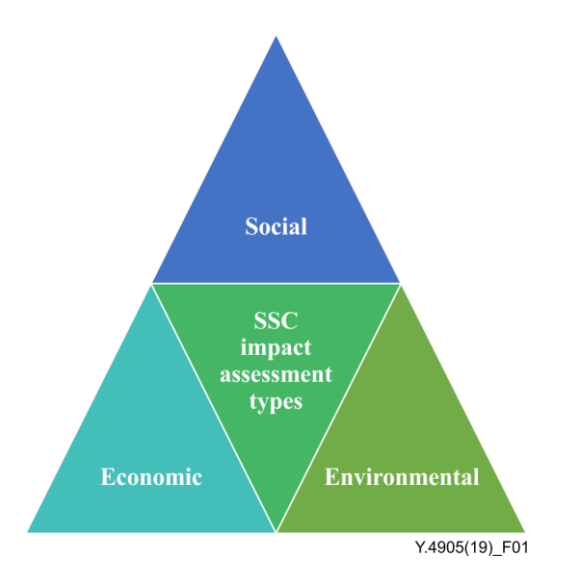
Figure 1 – Smart sustainable city impact assessment types

In this Recommendation, an SSC impact is assessed along social, economic and environmental dimensions (see Figure 1). This impact assessment can be used to understand the changes foreseen by SSC digital innovation initiatives. It can also be used to identify and circumvent negative and unintended impacts while capitalizing on, and further enhancing, positive and sustainable impacts.