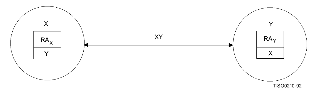
Figure 3 – Reciprocal relationship

In this diagram, the two managed objects X and Y have a direct relationship XY that is expressed both by the existence of the name of the object Y as a value of X's role attribute RA_X , and also by the existence of the name of the object X as a value of Y's role attribute RA_Y .