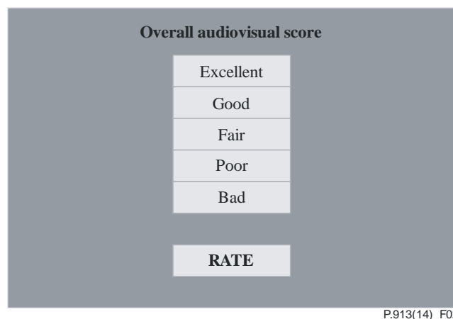
Figure 2 – Example screenshot of electronic voting for the ACR method

Electronic voting accomplishes the same data entry and has the advantage of automation. An example computer screenshot is shown in Figure 2.