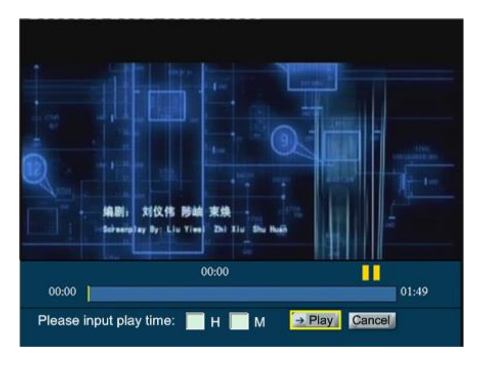
Figure II.1 – Example of the Event object controlling the media status