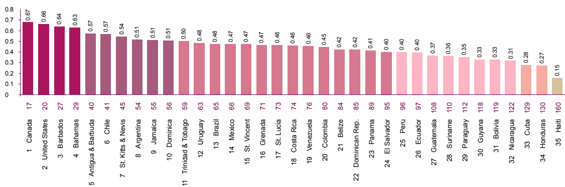
Overall Digital Opportunity Index scores, 2006

Notes: 1) higher score means better digital opportunity 2) numbers in purple show world ranks