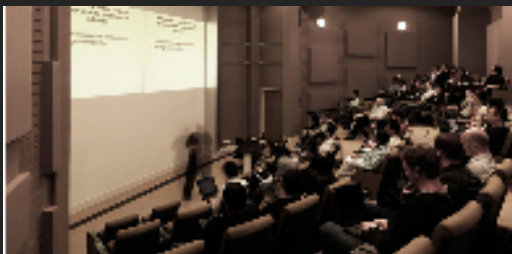
Centre for Training & Skills Development