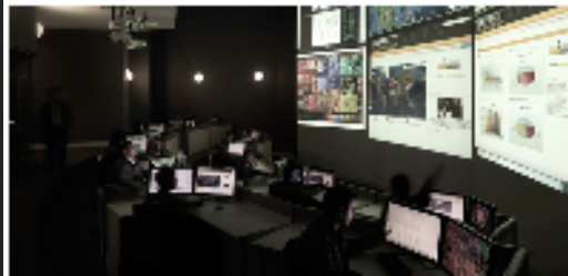
Global Response Centre