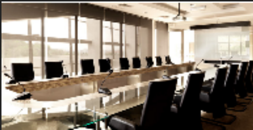
Centre for Policy & International Cooperation