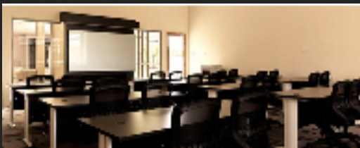
Centre for Security Assurance & Research