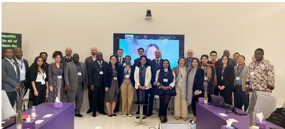
Figure 2: Digital for Development: UN in Action, UNGIS session at IGF 2024 in Riyadh

facilitating access for developing countries to new and emerging technologies. More information available here: https://www.itu.int/net4/wsis/ungis/ThematicMeetings