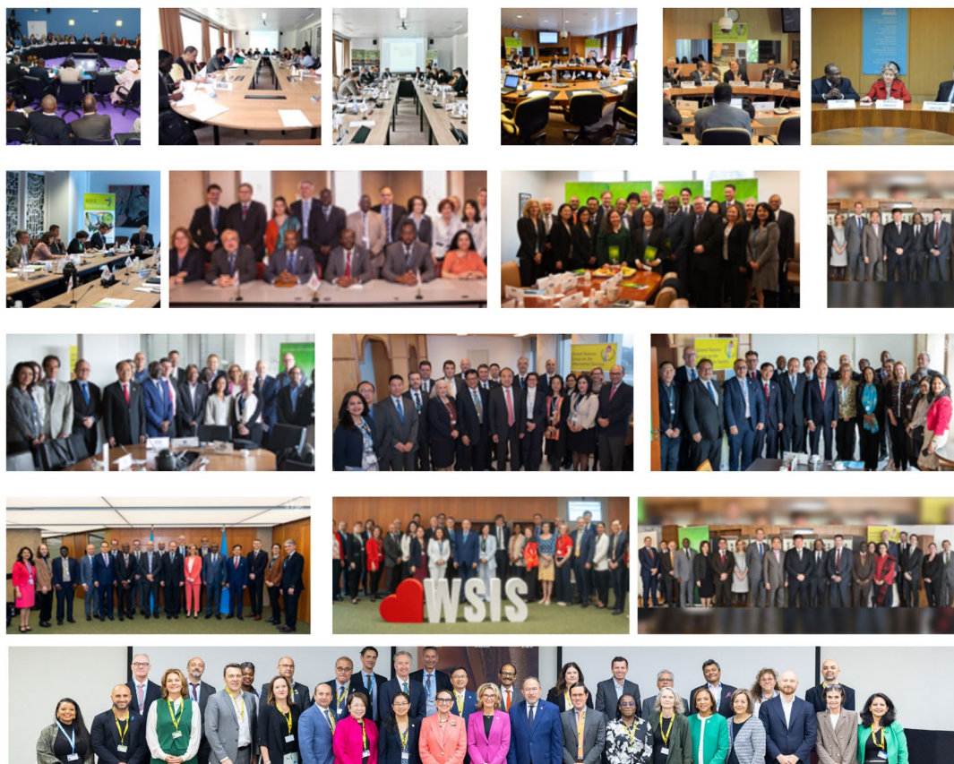
Figure 1: Annual UNGIS meetings