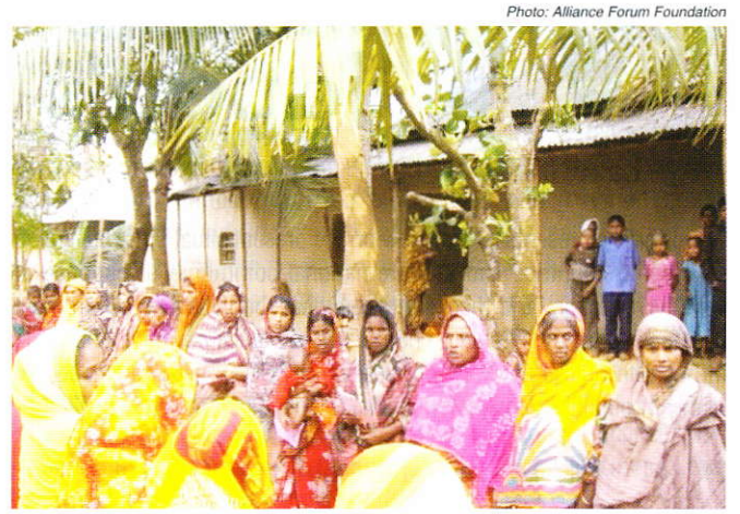
A group of women participating in a microfinance meeting with their peers

Microfinance, in which the fiduciary relationship between a lender and a borrower is rooted in personal knowledge of each other or an