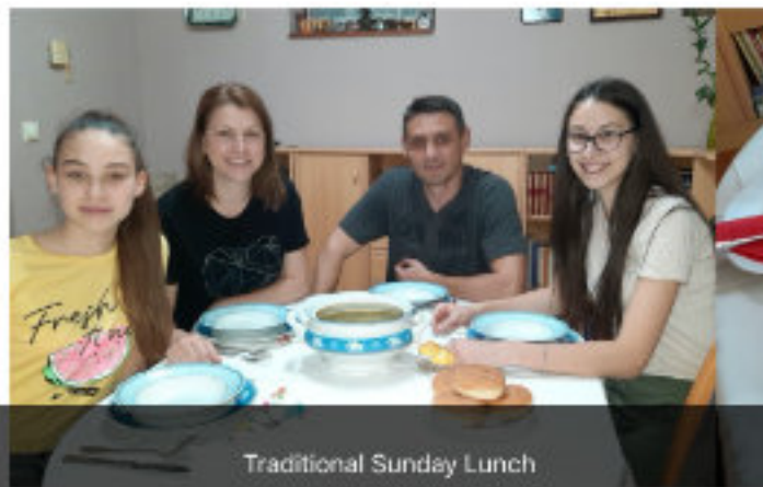
Traditional Sunday Lunch