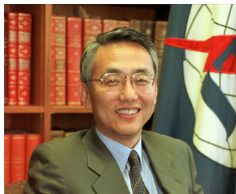
Yoshio UTSUMI Secretary-General ITU

We hope you will find in this guidebook a wealth of information to make your stay in Geneva most enjoyable. We hope that the information contained in this guidebook will enable you to make the most of this event and also encourage you to explore Geneva. There are numerous places to visit and experience in this dynamic city of contrasts and we, at ITU, wish you all a most pleasant stay in the City of Calvin.