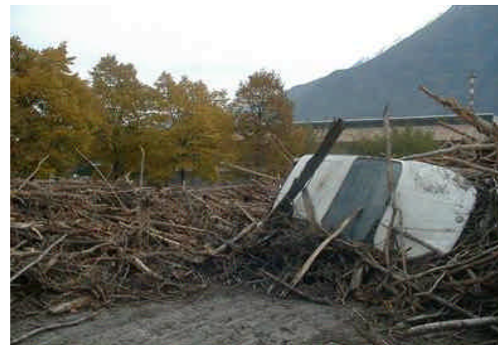
Workshop on Telecommunications for Disaster Relief, 17-19 February 2003