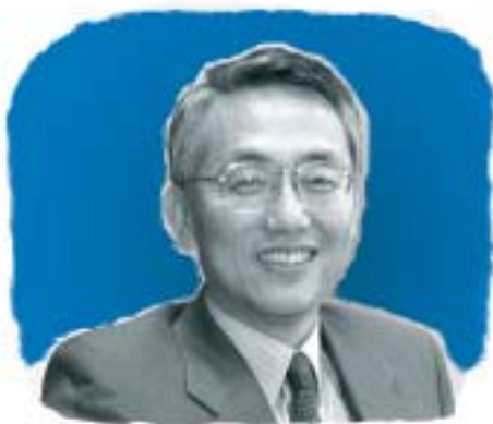
Yoshio UTSUMI Secretary-General of ITU

The Telecommunication Standardization Bureau (TSB) acts as the secretariat of ITU-T, organizing and coordinating the work of the sector. Mr Houlin Zhao, Director of TSB, was elected at the 1998 Plenipotentiary Conference in Minneapolis (USA), and was re-elected for a second term (2003-2006) as Director of TSB at the 2002 Plenipotentiary Conference in Marrakesh (Morocco).