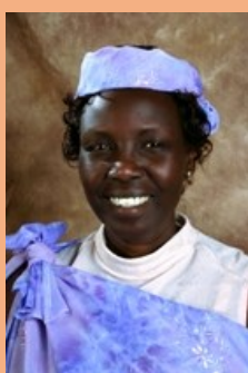
H.E. Ms Rebecca Okwaci, Minister of Telecom & Postal Services, Republic of South Sudan