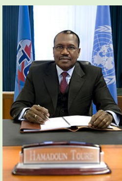
Dr Hamadoun Touré, Secretary General, ITU