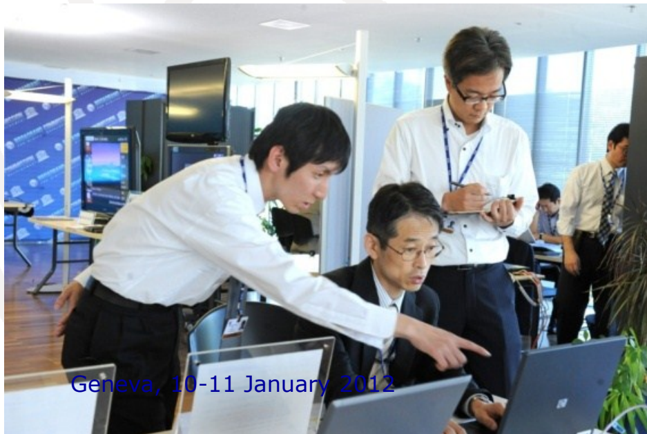
Geneva, 10-11 January 2012