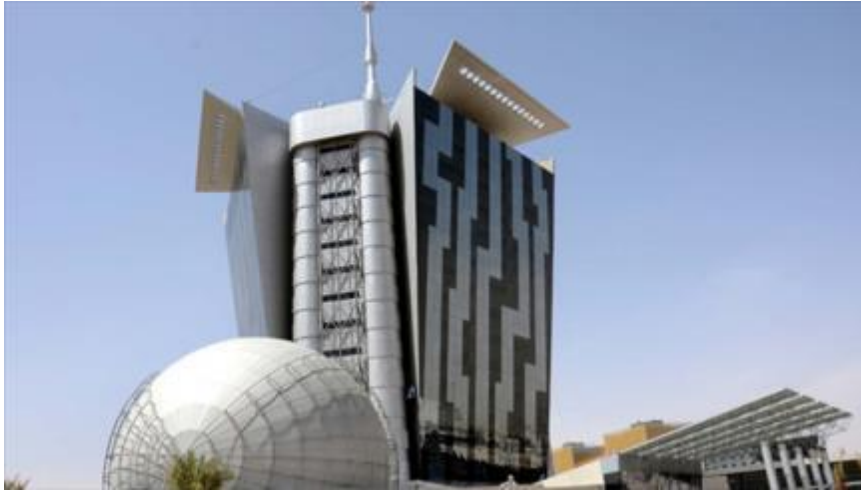
The CITC building