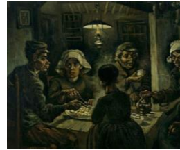
1885 Vincent van Gogh Potatoe-Eaters Nuenen