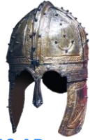
319 AD The Golden Roman Helmet of De Peel