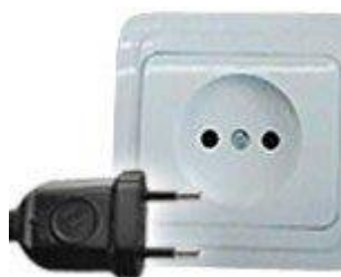
Type C: This socket also works with plug E and F