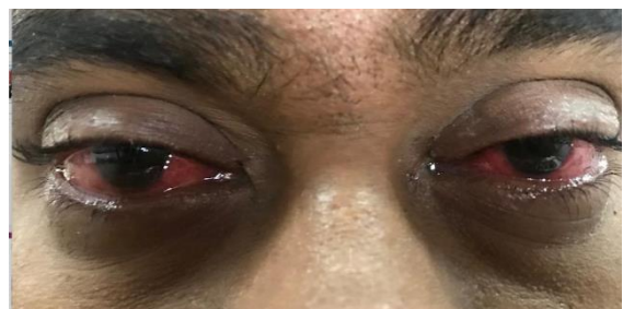
Figure 4 – Gold standard: Infective conjunctivitis

In Figure 3 , the examination shows that the patient's eyelashes are not touching the eyeball and the patient has good eyelid closure. From the image it is noted that the patient has circumcorneal redness and a clear cornea. Therefore, the flowchart reveals the correct diagnosis of Iritis.