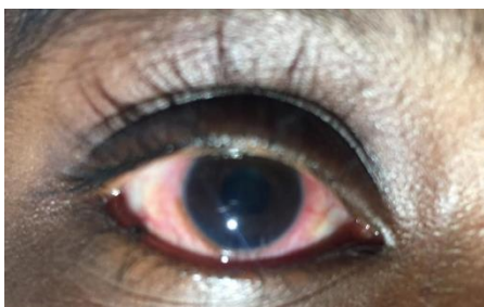
Figure 3 – Gold standard: Iritis

Examples of application of the algorithm are shown in Figure 3 and Figure 4 .