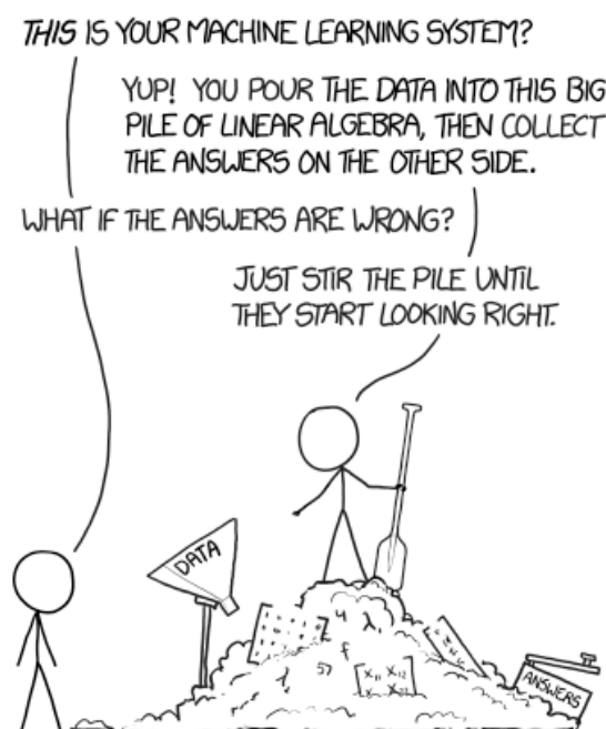
Figure 1 – Machine learning, xkcd.com

Machine learning algorithms build a model from training data , i.e., historical examples, in order to make predictions or decisions rather than following only pre-programmed logic. Neural networks analyze data through many layers of hardware and software. 25 Each layer produces its own representation of the data and shares what it “learned” with the next layer. Machine learning learns by example, using the training data to train the model to behave in a certain way. 26 Machine