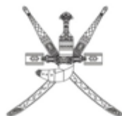
Information Technology Authority Sultanate Of Oman