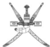
Information Technology Authority Sultanate Of Oman