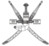
Information Technology Authority Sultanate Of Oman