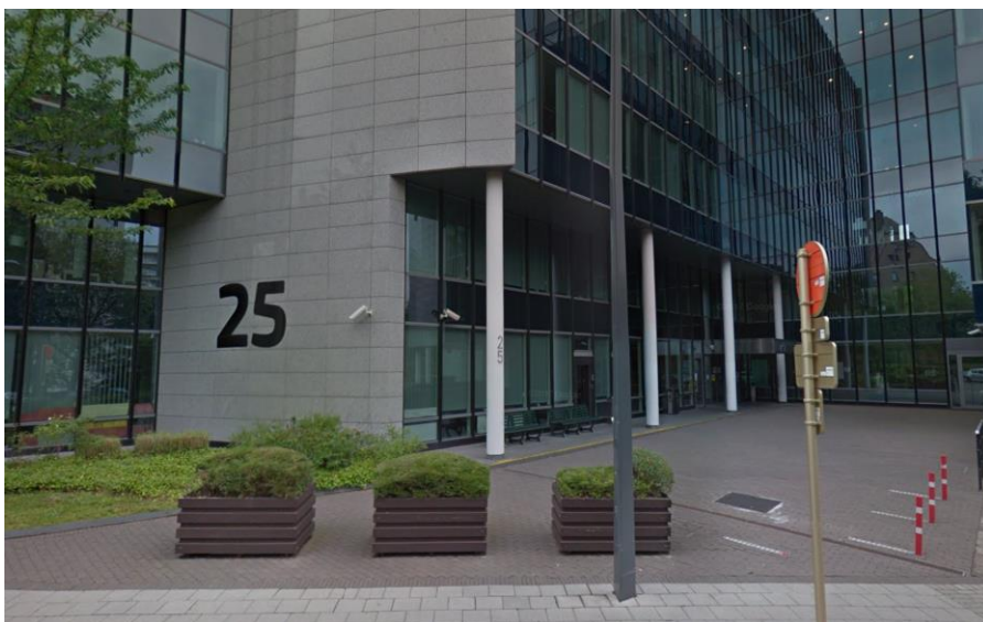
Photo of the Venue