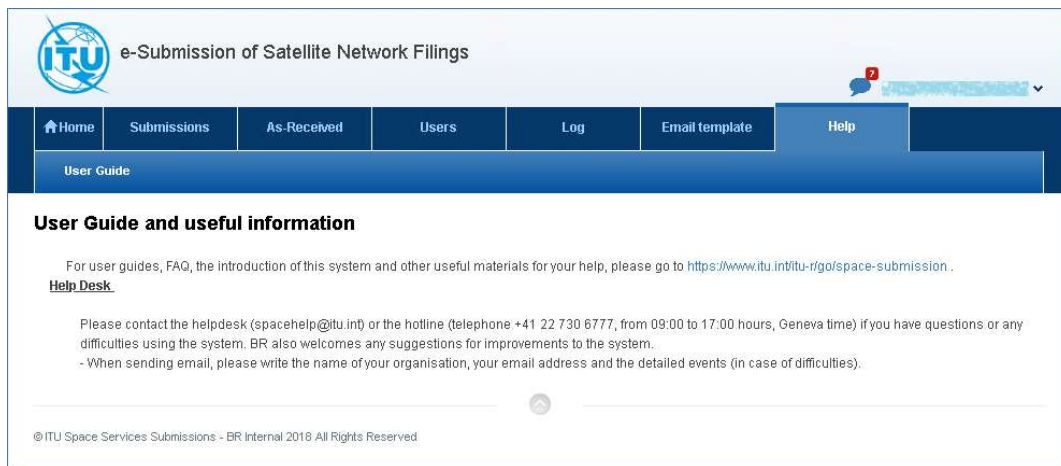
Fig. 42 User Guide page.

User manuals, FAQ (Frequently asked questions) and other useful materials and links to webpages are available at https://www.itu.int/itu-r/go/space-submission page. Users of the system are navigated to that page via the link available on Help->User Guide (Fig.42). The uploaded materials describe and correspond to the provided functionality of e-Submission of Satellite Network Filings Release 1.