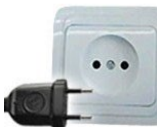
Type C: This socket also works with plug E and F