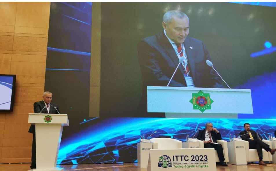
May 3 - 4, 2023, Ashgabat, Turkmenistan "International transport and transit corridors: interconnectedness and development - 2023" ITTC - 2023