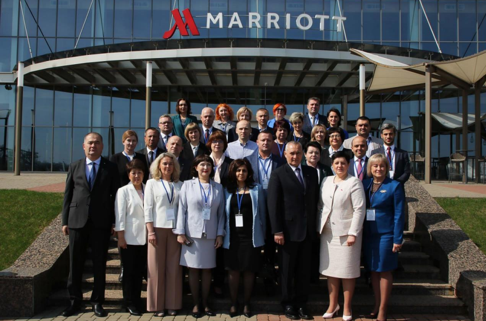
April 19, 2023, Minsk, Republic of Belarus 54/43rd joint-meeting of the RCC Postal Commission, RCC Postal Operators Board and their Working Groups