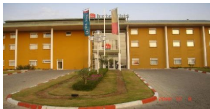
Hôtel IBIS Cotonou