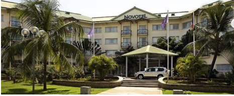
Hôtel Novotel Cotonou Orisha