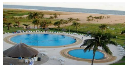
Bénin Marina Hôtel