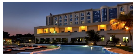
Azalai Hôtel de la Plage