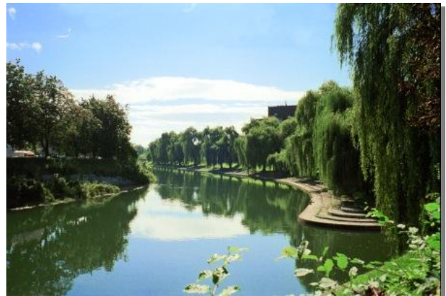
Ljubljana and surroundings