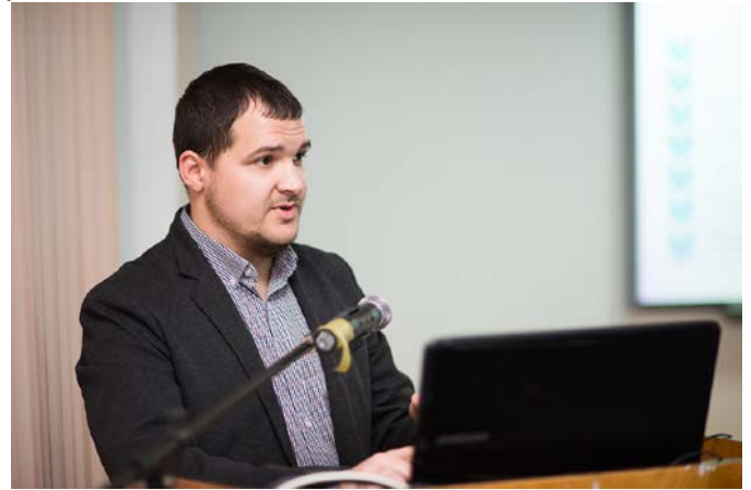
Speakers of the Workshop