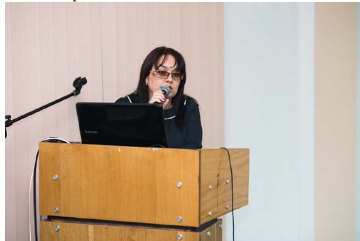
Speakers of the Workshop

The training workshop was attended by 76 school principals Odessa city , as well as representatives of regional departments of education.