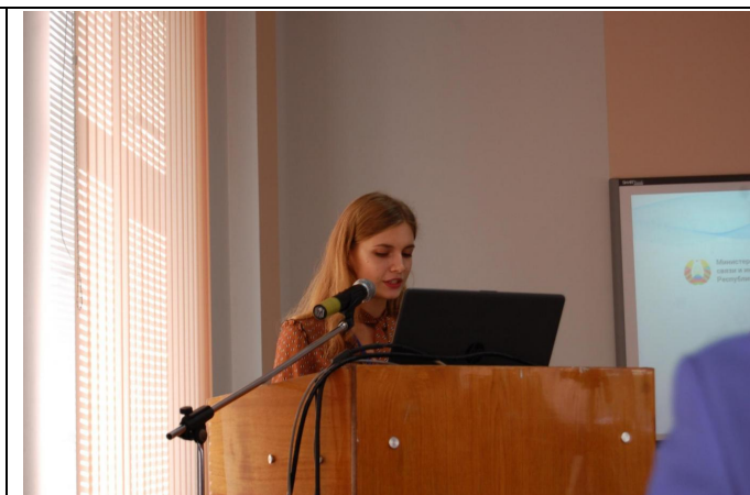
Speakers of Session 1