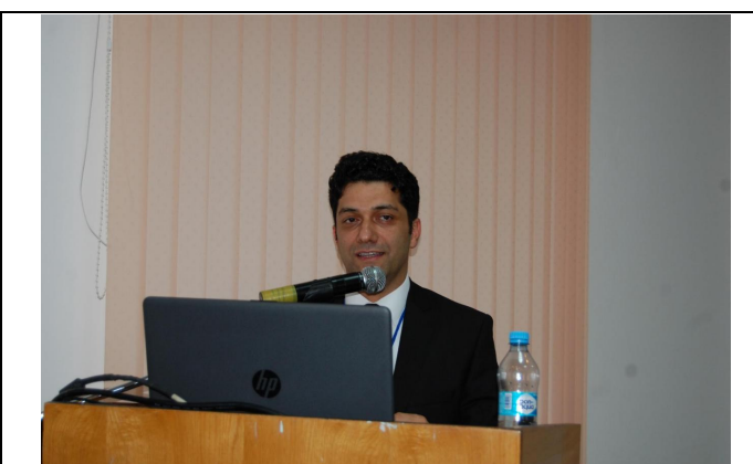
Speakers of Session 2

During the second day of work (October 18, 2018), 8 reports were presented, within two sessions: