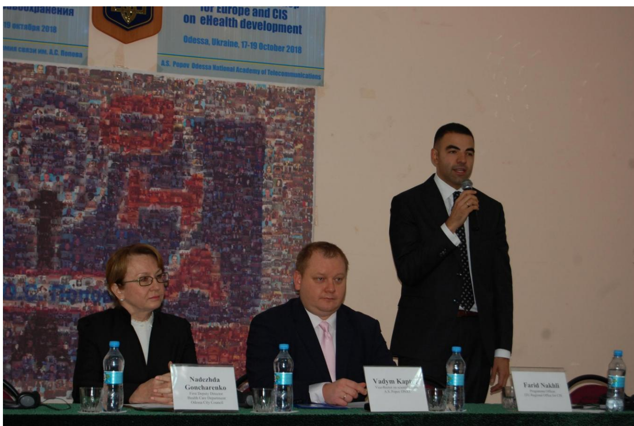
The grand opening of the Workshop