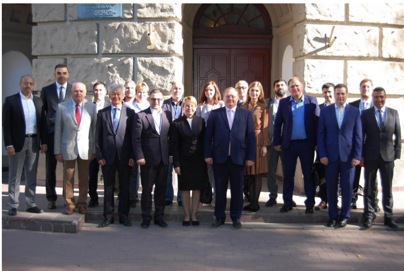
Group photo of the Workshop Participants

The Workshop was attended by more than 40 people who represented 22 organizations from 12 states , namely: the Republic of Austria, the Republic of Belarus, Greece, Iran, the Kyrgyz Republic, the Republic of Moldova, Slovenia, Switzerland, Turkey, Ukraine, the United States of America, Japan.