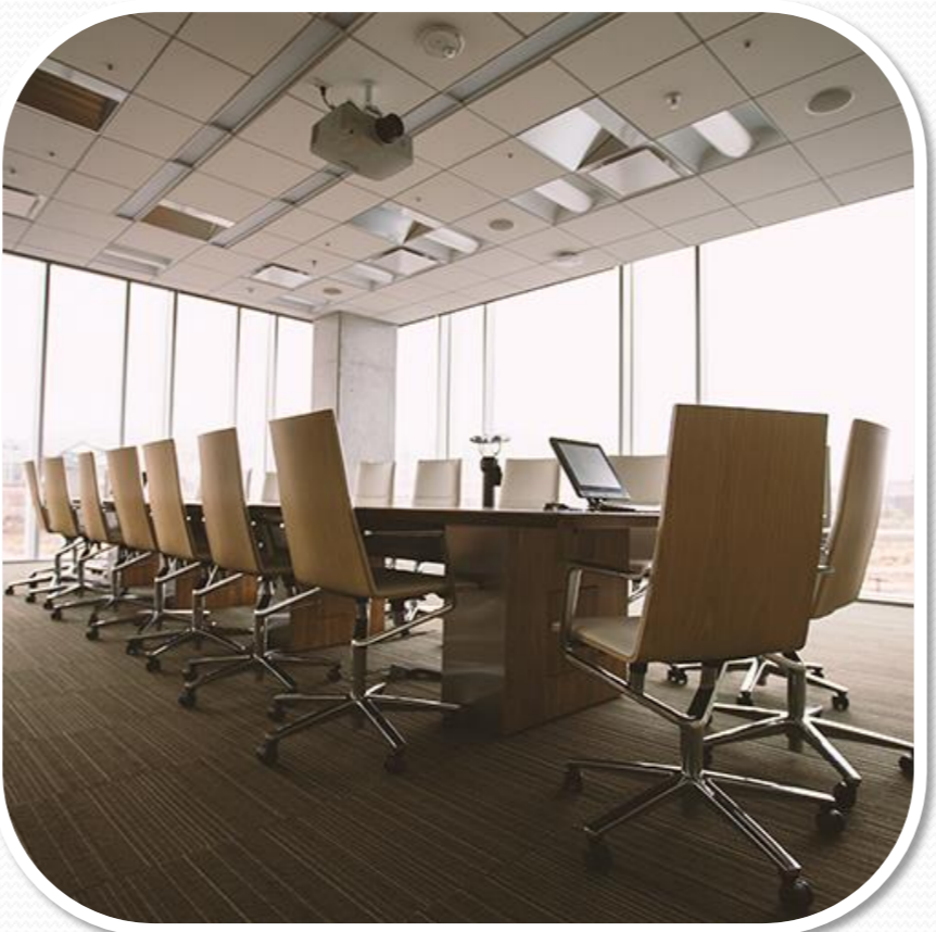
Attracting entrepreneurs and foreign IT companies – Team sourcing