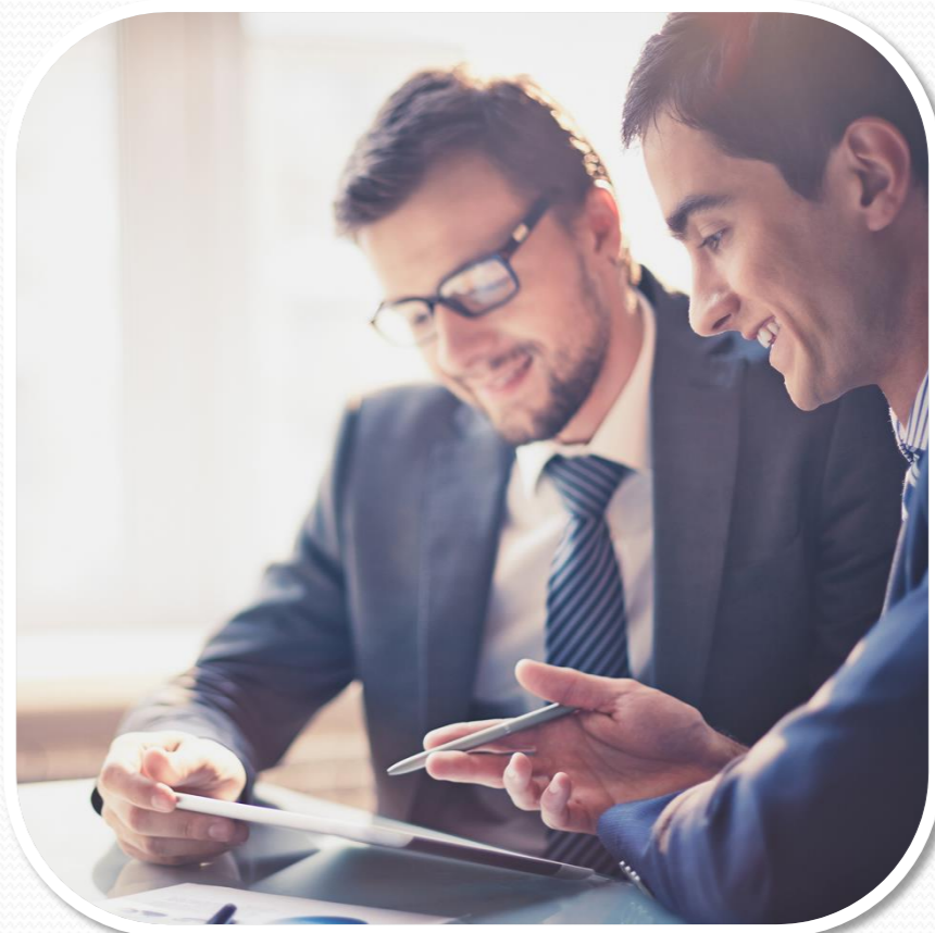
Attracting IT professionals – Startup Visa