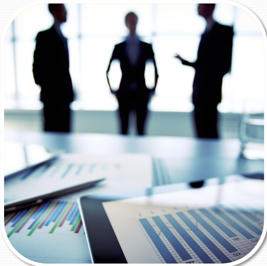
Replenishment of the growing demand for skilled labor

For covering current and urgent demand of qualified IT workforce is necessary to attract qualified human capital from abroad