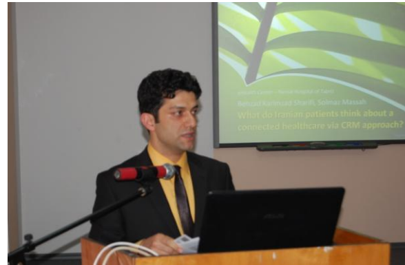
The speakers of the Seminar