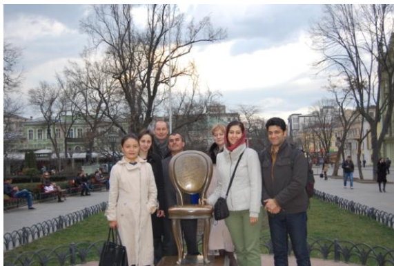
Excursion in the city Odessa