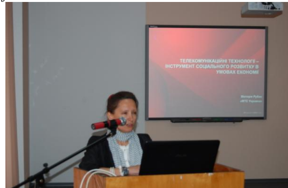
The speakers of the Seminar