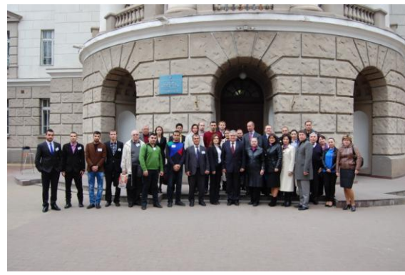
Photo of the participants of the Seminar