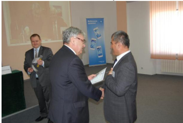
Presentation of certificates to participants of the Seminar