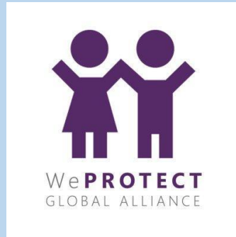
Global CSO Member