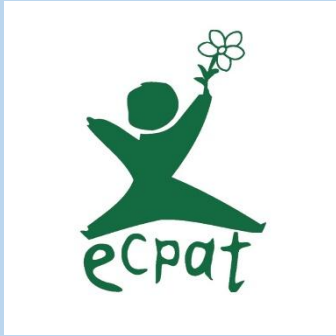
Global Network Member