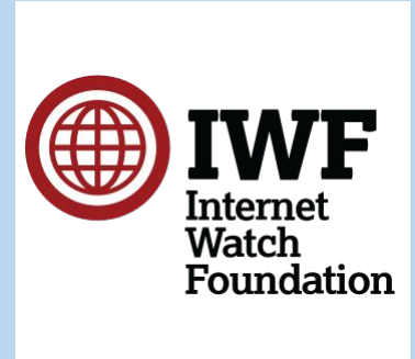
Reporting Portal Partner