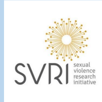
Global Research Advisor