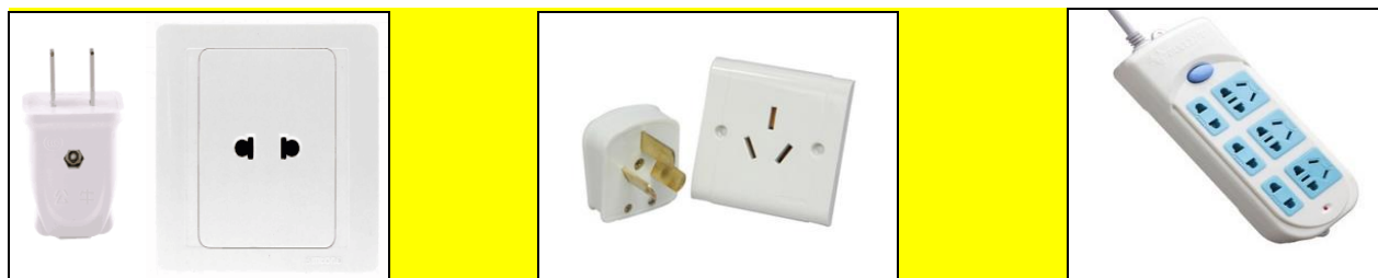
Two parallel outlet holes

The standard power supply in China is 220 volts, the frequency is 50Hz. The type of power outlet/connector used in China is a two parallel outlet-hole or three-hole outlet triangle. For the convenience of participants to use, we will provide wiring board, which is porous outlet.