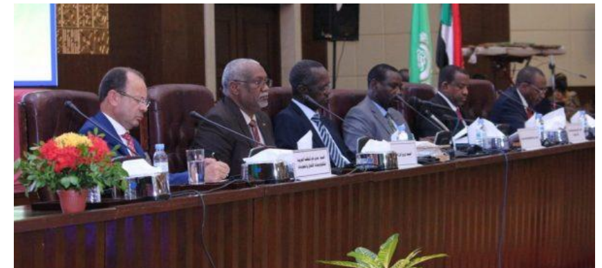
1st inter-regional smart agriculture forum - ISAF

10 April 2018, Tunis –Republic of Tunisia