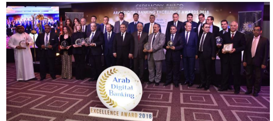
Awards Ceremony for the Best Arab Digital Banks

3rd of January 2019, Tunis –Republic of Tunisia