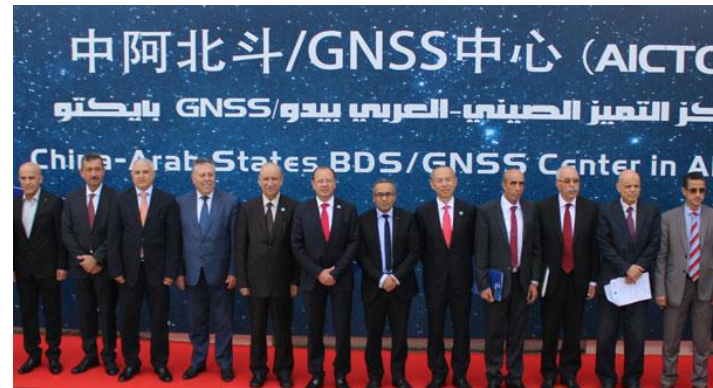
Official Opening of the Center of Excellence "China-Arab BDS/GNSS Center-AICTO"

11/12 December 2017, Muscat – Sultanate of Oman