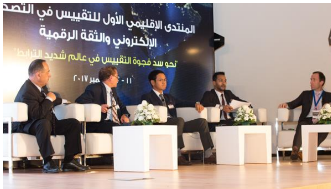
1 st First Interregional Standardization Forum for PKI and eTrust

11/12 December 2017, Muscat – Sultanate of Oman