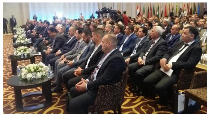
2 nd ICT & Investment forum

24-26 September 2018, Khartoum, Republic of Sudan