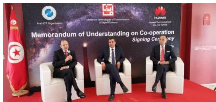
New Strategic partnership between AICTO, the Tunisian MCTDE and Huawei

3-4 December 2018, Baghdad, republic of Iraq