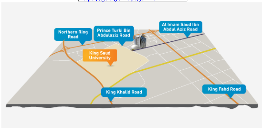
Map of CITC