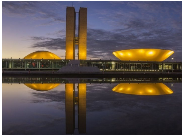
(Brazilian Congress in the late afternoon)

Organized by the Telecommunication Development Bureau (BDT) of the International Telecommunication Union (ITU) in partnership with the National Telecommunications Agency (Anatel).